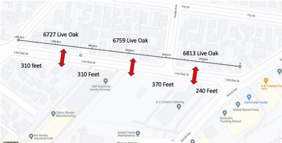
Proposed approximate location of Speed Humps on Live Oak Street