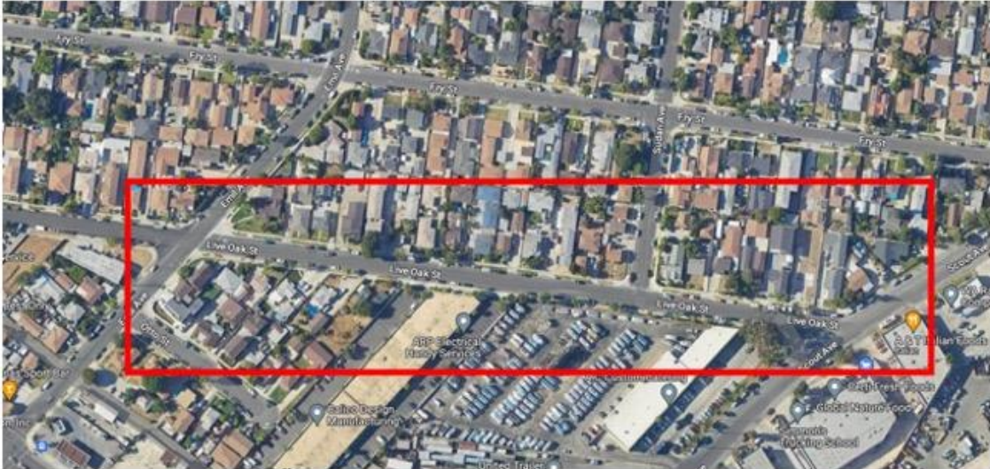
Live Oak Street from Emil Avenue to Scout Avenue