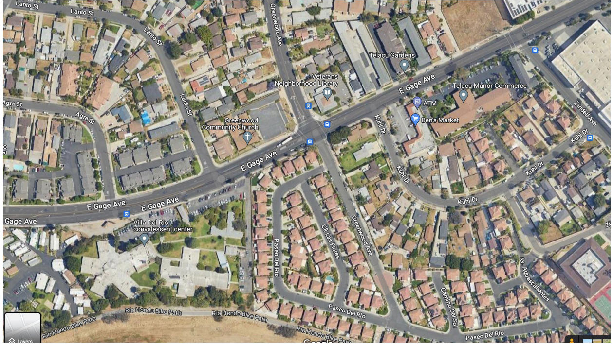
Exhibit 1 – Existing Conditions