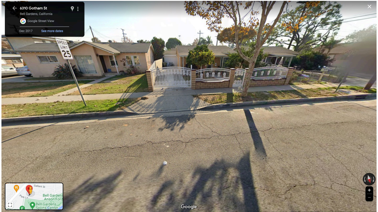
Exhibit 1 – Aerial and Street View of Subject Residence