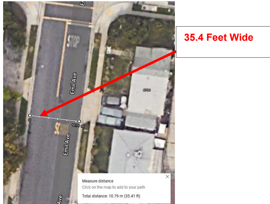
Figure 2 – Aerial View of the Emil Avenue Street Width Curb to Curb

Figure 2 provides an aerial view of the street width of Emil Avenue illustrating that the street meets the speed hump policy requirement of being less than 40 feet wide.